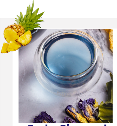
Perky Pineapple Ingredients: Pineapple, Pandan, Butterfly Pea