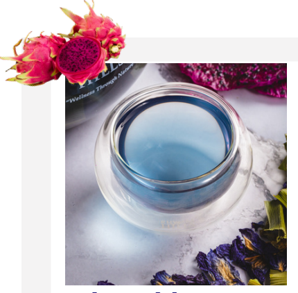
D'lectable Dragon Ingredients: Dragon Fruit, Pandan, Butterfly Pea